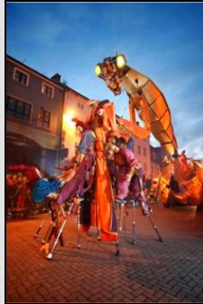
Kilkenny Arts Festival 2008

July 4-12: Clonmel Junction Festival , County Tipperary. A nine day festival offering a rich mix of modern theatre, dance and music. Great family entertainment. www.junctionfestival.com